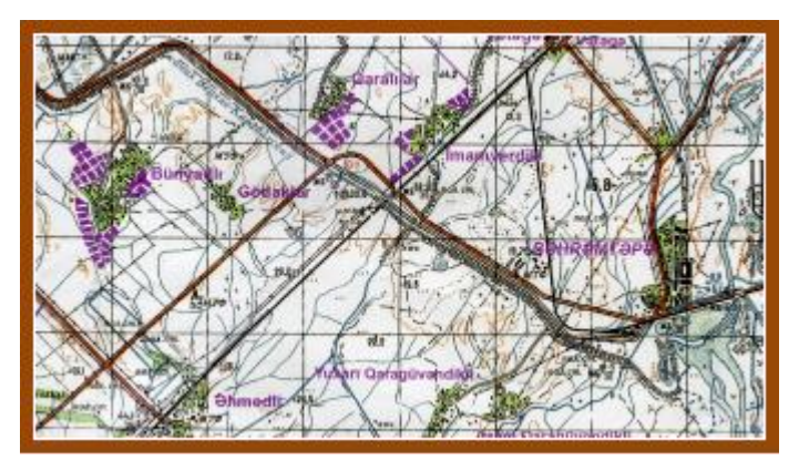
Figure 2. Map of terrain changes (fragment)

Operative correction of topographic maps produsing faster than updating them. When conducting military operations, a great need is shown for them, they are more effective and are used by troops everywhere.