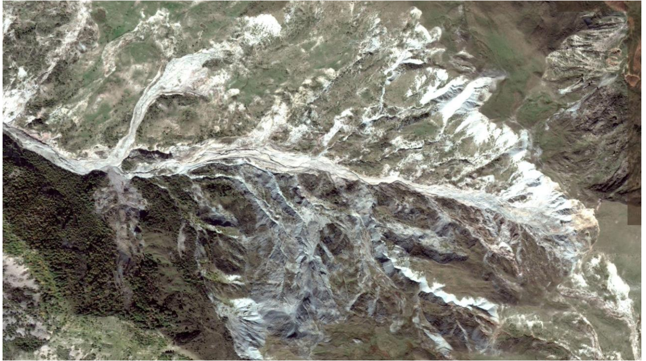
Figure 4. The sleeve of the Garauzchay landslip-stream, which has an east-west strike