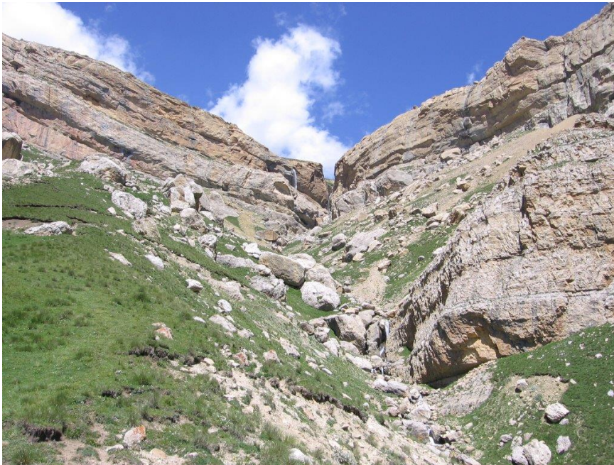
Figure 1. The rocks of Shahdag massive which may be the material of mood flow streams.

Essential influence on development slope slide processes renders the inclination of a terrestrial surface saving in considerable energy of all weight of breeds of a slope. But, as it is known, the big biases of slopes not always lead to landslips, even on close located to slope slide files sites. So, slopes with firm parent breeds are steady, slopes with alternation of layers of friable breeds and clays are the most subject to influence of geodynamic factors. The big biases of slopes, especially characteristic for the Southern slope of the Main Caucasian ridge lead to landslips of landslide character, in a root changing shape of a landscape of the given site (Mardanov and Hajizadeh, 2003; Budagov et al., 2005, Mardanov et al., 2005).