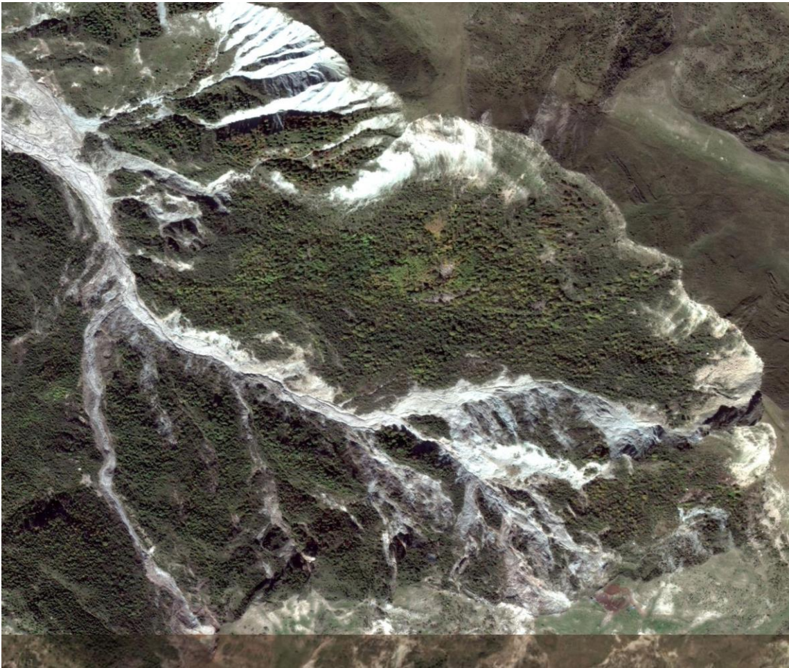
Figure 5. The sleeve of the Garauzchay landslip-stream, having a south-north strike and capturing all new areas, reflected by a light phototone separating them from the adjacent mountain forest and mountain meadow landscapes (a photo of the company "Google" (USA), with a resolution of 1 m, filmed September 29, 2012-th year)